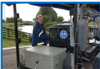
High Capacity Pumps

Programme activities are grouped into two closely interrelated lots (Lot 1 and Lot 2) which implementation falls under two separate grant contracts. Lot 1 officially started implementation on 1 st January 2015 . The signing of the grant contract for Lot 2 is expected to be finalized in the next months.